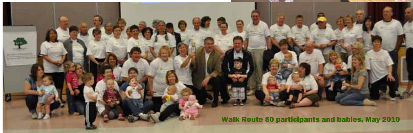
Walk Route 50 participants and babies, May 2010