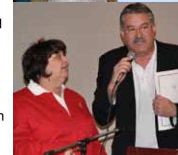
We received many accolades from the community on our 10Th Anniversary celebration.